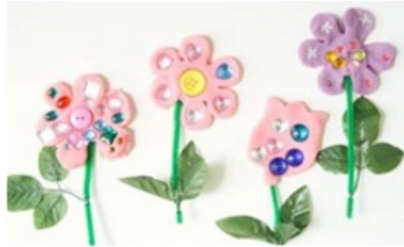
Flower Garden Play Dough

Count the number of petals, or gems on each of your flowers. You may also extend this activity by sorting materials by color, number, shape or size.