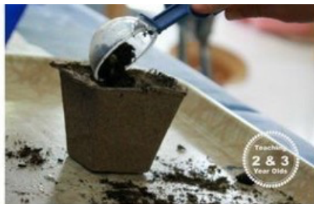
Planting Seeds with preschoolers